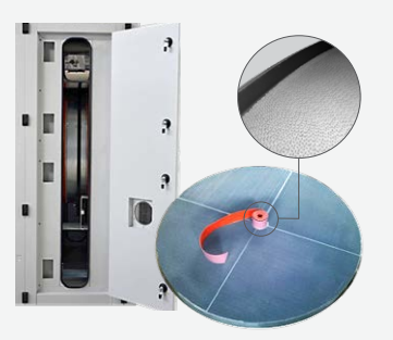
Desiccant rotor consisting by 82% from silica gel which has high moisture absorbing ability. The lifetime of the rotor under normal circumstances is 10-15 years.

The fans are installed on the special rubber shock absorbers in order to minimize the vibration.